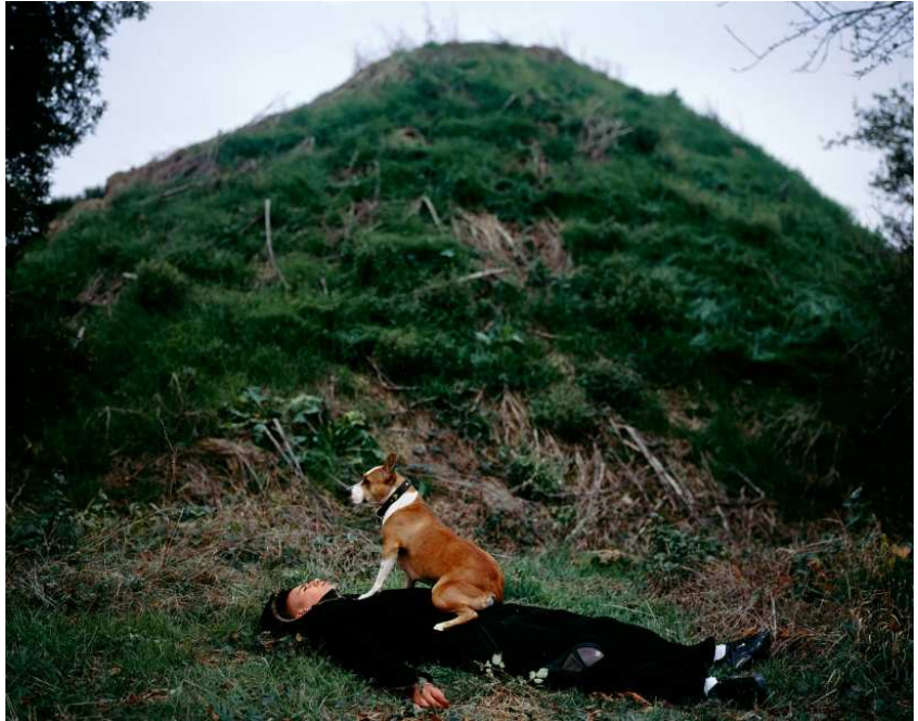
La butte, 2007