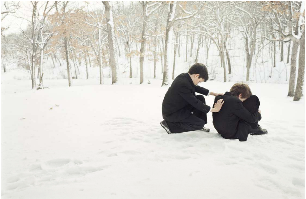
Untitled (Turns Gravity) #3, 2010