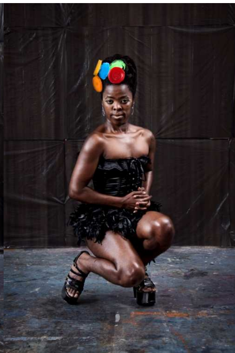
Miss Lesbian IV. Amsterdam, 2009