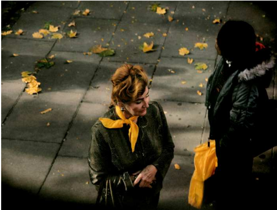
Untitled, November, 2007