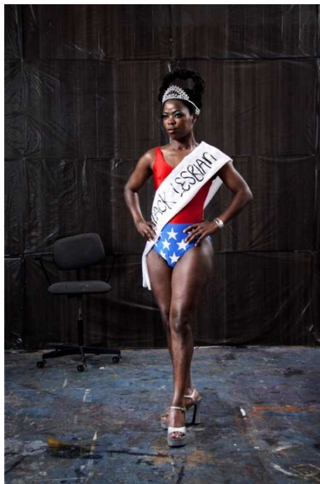
Miss Lesbian V. Amsterdam, 2009