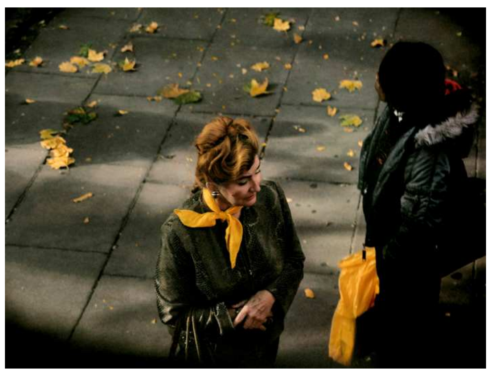
Untitled, November, 2007