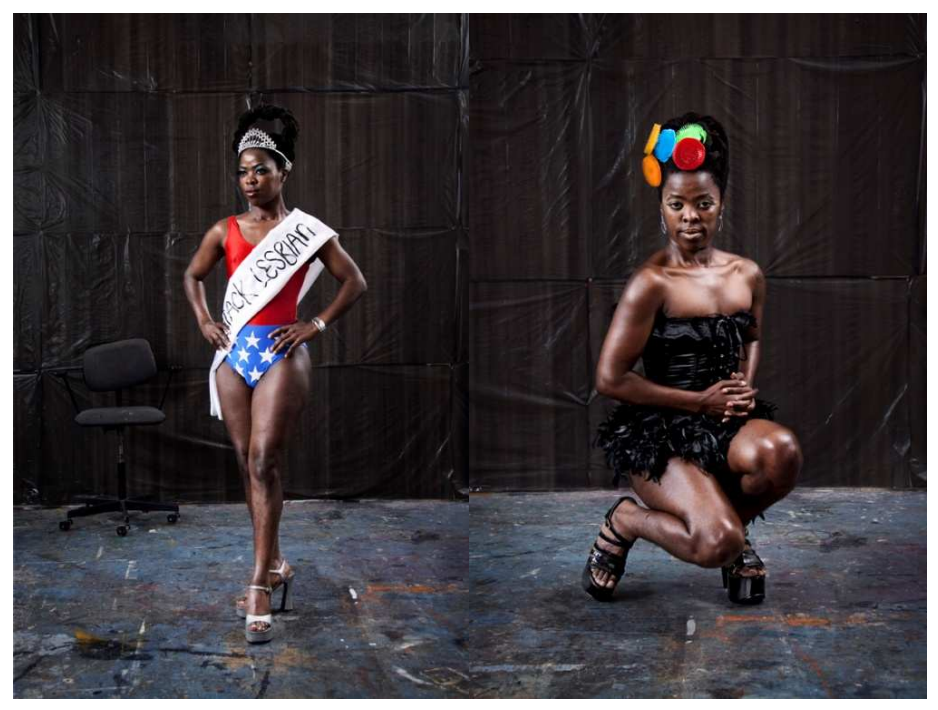
Miss Lesbian V. Amsterdam, 2009